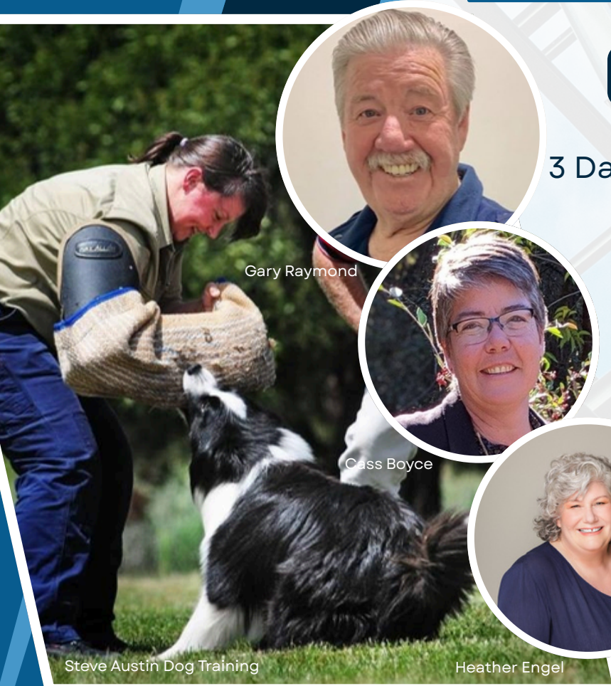
Steve Austin Dog Training